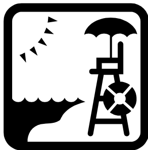
Swimming Every Monday!

Each Monday beginning June 14, we will take kids who have finished grades Kindergarten, 1, 2, 3, 4, or 5 to the Tate Street Pool in Lawrenceburg. This pool offers a full staff of trained life guards, a water playground and a great water slide! Cost is $6.50 per day and includes admission and transportation. Fees will be charged to your GBT account. The children will eat lunch at GBT and then we will board the bus at noon. We will leave the pool at 4:00